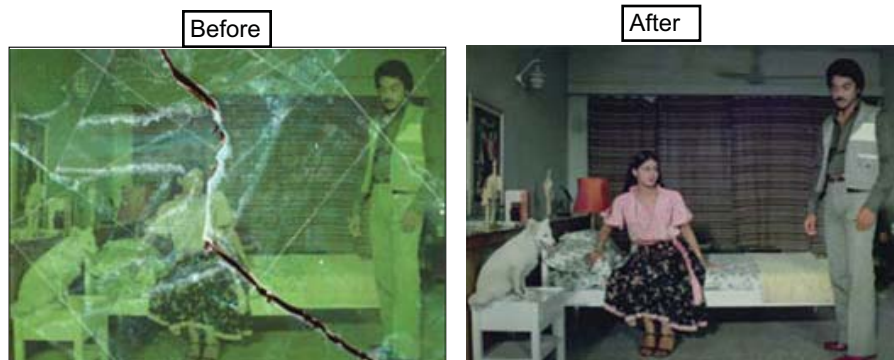
Still from Ek Duije Ke Liye (1981)